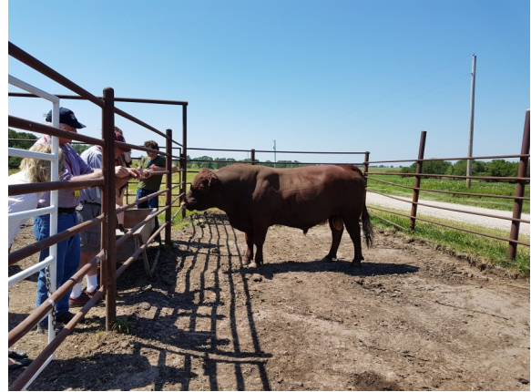
Womelsdorf Red Polls, Kansas