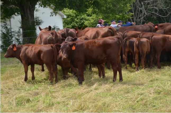
Wilkshire Red Poll Stud, North Carolina