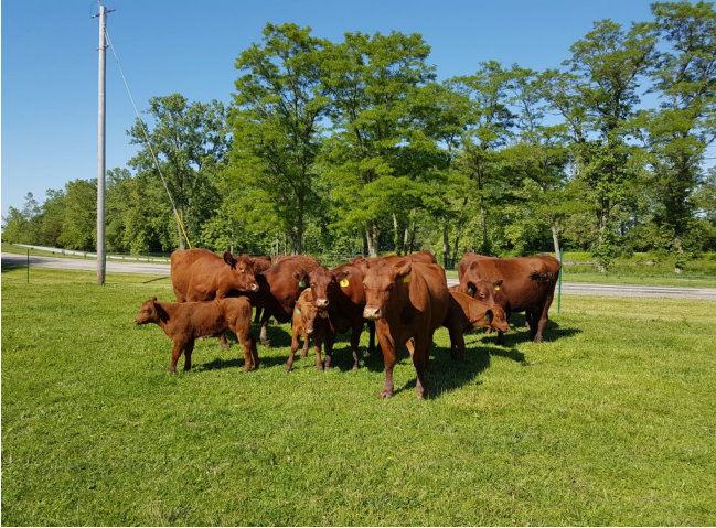
Jackson Farms, Indiana

2017 World Congress USA