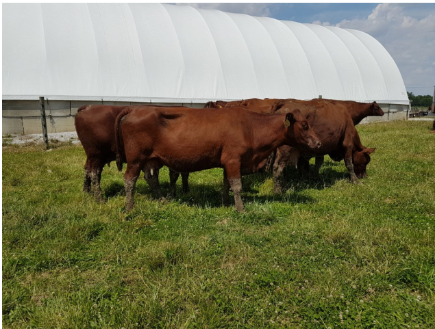
Shuter Sunset Farms, Indiana