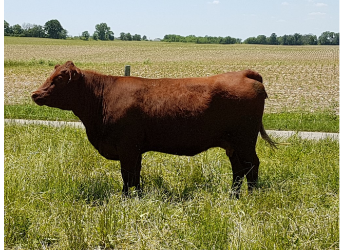
Spegal's Red Polls, Indiana