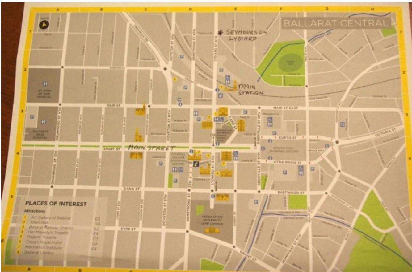
Map of Ballarat