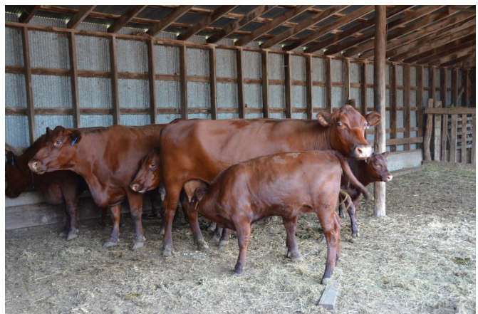
Wiese Family Farm, Kansas