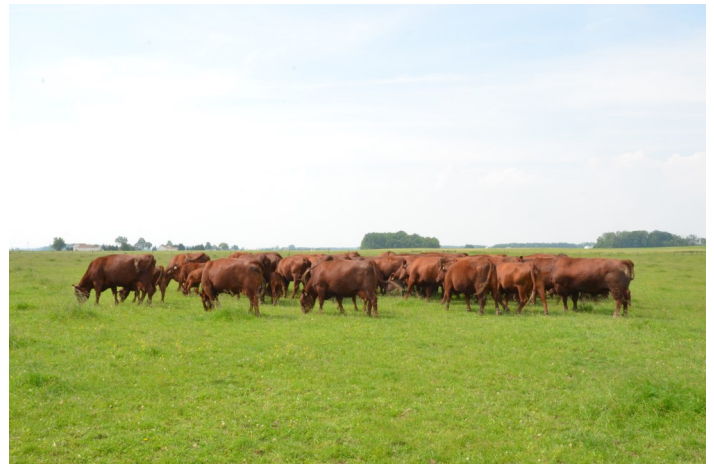
Carl's Red Polls