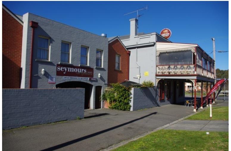
Seymours On Lyddiard