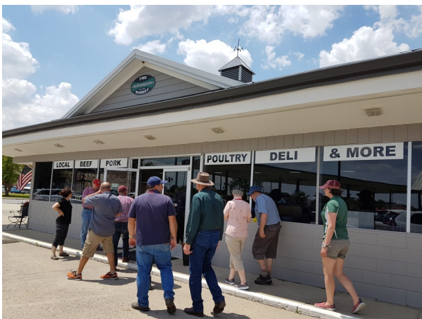
The tour group at Shuter Sunset Farms Store