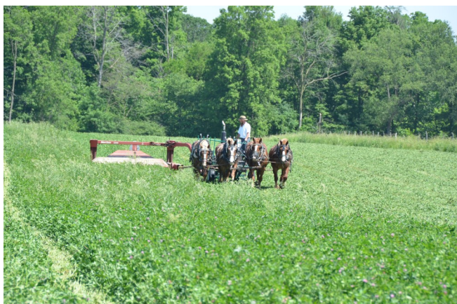
Amish man mowing hay in one of the lushest pastures we've ever seen, Indiana