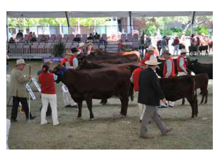
Judging at Sydney 2015